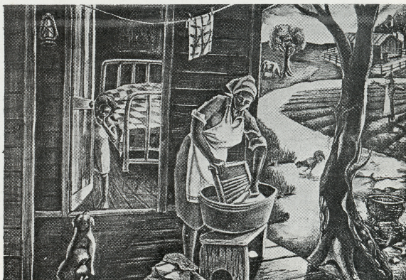
"Early Morning Wash"

The Water Well The Kitchen House of Worship Wood-Gathering Early Morning Washing The Family at Home